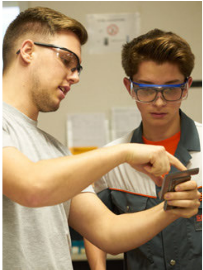
Every year, apprentices from the US and Switzerland are offered the opportunity of an internship of several weeks in other cultural and language regions.

It is a matter of concern to SFS that diversity is maximized in the organization’s administration, management, supervisory bodies and interdisciplinary teams in terms of age, gender, educational and professional background. However, in the materiality assessment passed by the Group Executive Board on December 7, 2016 this topic was not accorded priority by any of the participating stakeholder groups. As we want to focus our efforts on the most important goals and measures (see page 34), there are currently no specific concepts being developed or implemented to foster diversity.