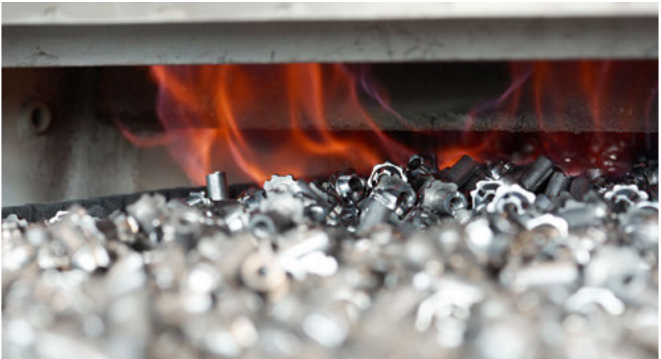
The new heat treatment system, now equipped with low-emission flameless oxidation (FLOX) burners, reduces CO 2 emissions.

In India, Indo Schöttle, that was acquired by SFS in 2014, received a “Best Overall Sustainable Performance Award” from Mahindra, India’s largest vehicle manufacturer. This important award was presented in recognition of achievements in the utilization of alternative energies, energy conservation and corporate social responsibility. Mahindra singled out Indo Schöttle’s outstanding sustainability initiatives, which included new solar and hybrid power generation installations at the Pune site, a rain water harvesting system at Belgaum, an investment in four high-volume ventilators and a campaign to plant some 500 trees.