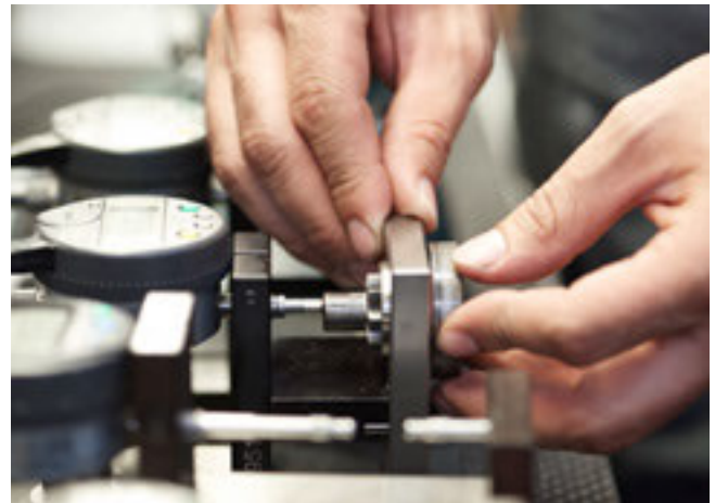
All ISO14001-certified sites define specific environmental objectives each year. Moreover, SFS plans to train experts for ISO 14001 certification at the sites.